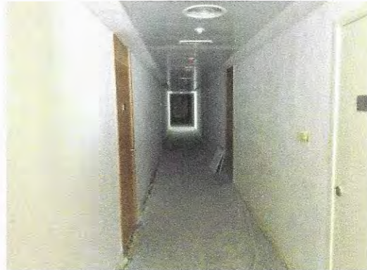
Common Corridor – 2 nd Level