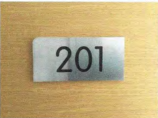
Unit No. 201 (Show Apartment)