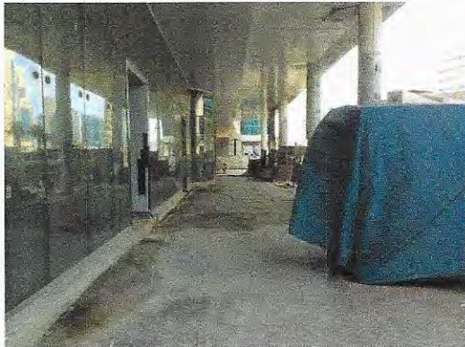
The Pad – front entrance area