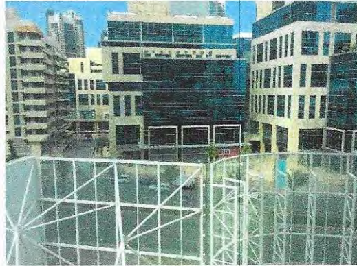
View – Community