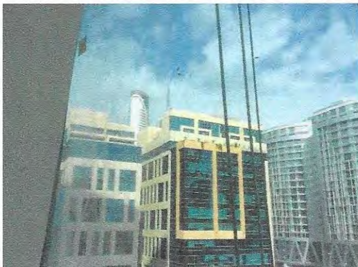
View - V. partial Burj Khalifa / Community