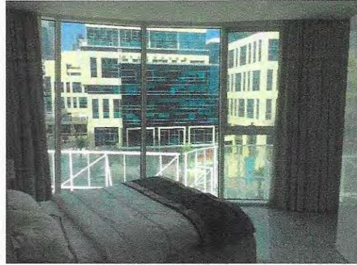
Bedroom - Unit No. 201 (Show apartment)