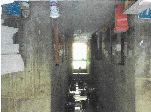
The Pad Tower – Main lobby