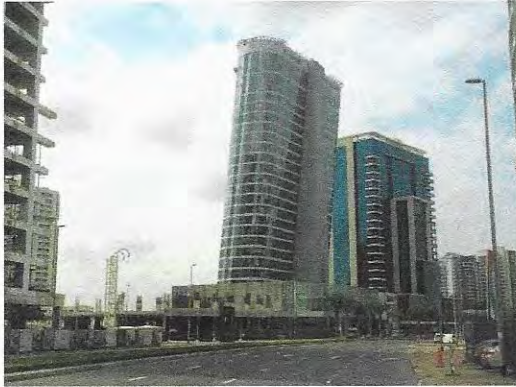
Subject Tower (The Pad)