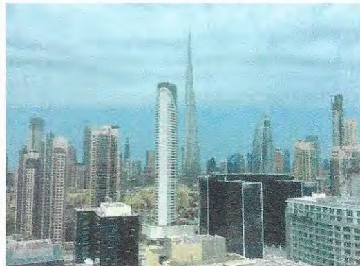
View – from high floor – Burj Khalifa