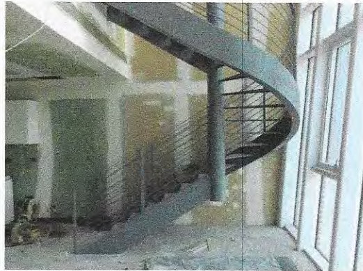
Integrated living/dining / staircase – loft unit