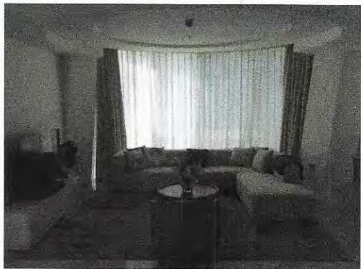
Integrated living/dining area – Unit No. 201 (Show apartment)