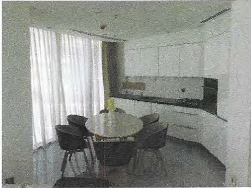
Kitchen – Unit No. 201 (Show apartment)

Plot No. 72, 30 (Serviced Residential Apartments) in The Pad Tower, Business Bay, Dubai, United Arab Emirates.