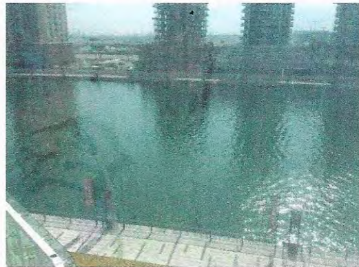
View – Canal