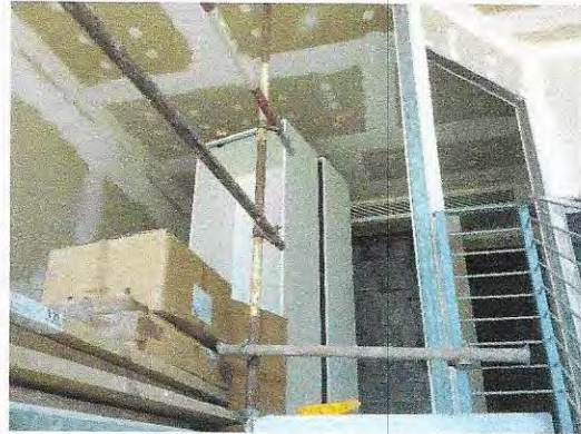
Loft – upper level