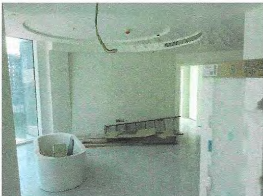
Integrated living/dining area