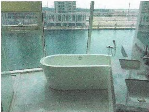
Bathroom - Unit No. 201 (Show apartment)