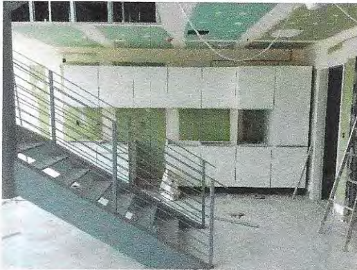
Integrated living/dining / staircase – loft unit